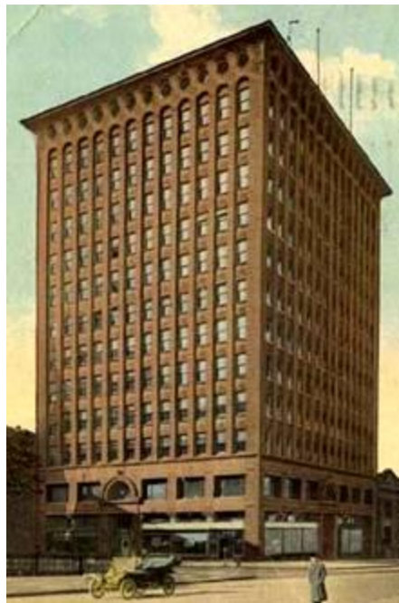
The Guaranty Building, 1894-95, by Adler and Sullivan

SUNDAY, April 25: We will check out early and after breakfast again welcome the local guide to our bus and head into downtown Buffalo at 9:00am, with box lunches in hand, to see the famous Guaranty Building by Louis Sullivan, Burnham's Ellicott Square Building and other "must see" buildings, including some of the elegant residences along Delaware Avenue designed by the likes of McKim, Mead & White and a firm well known in this state for decades: EB Green and Wicks.